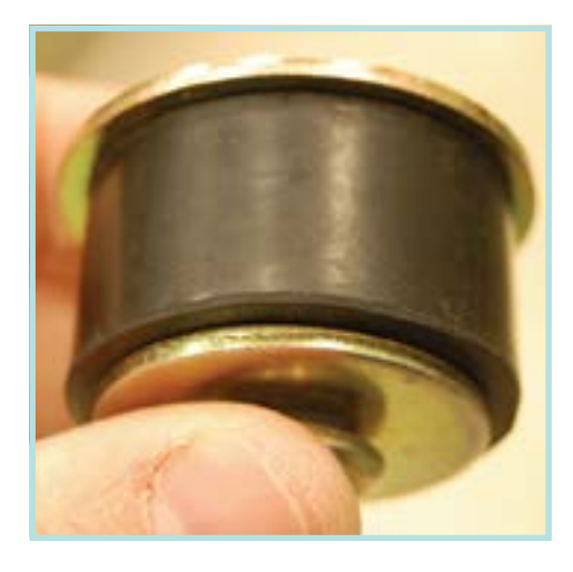
Figure 17. Marine/automotive plug.

To plug the overflow, remove the overflow cover and install a properly sized drain plug. You may need to purchase an automotive or marine plug since the overflow drain is shallow. (Figure 17, 18)