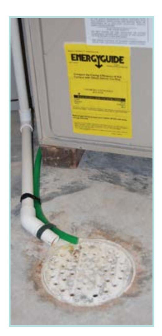
Figure 10. Floor drain.

If floor drain grates are removable, install drain plugs. Backflow float valves can be installed in floor drain pipes that only allow flow in one direction. These plugs work well in homes with new furnaces that have condensation drains leading into a floor drain. The float valve will keep sewage from seeping into the home and the furnace can continue to drain. (Figure 10)