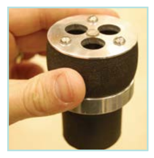
Figure 8. Floating backflow valve.