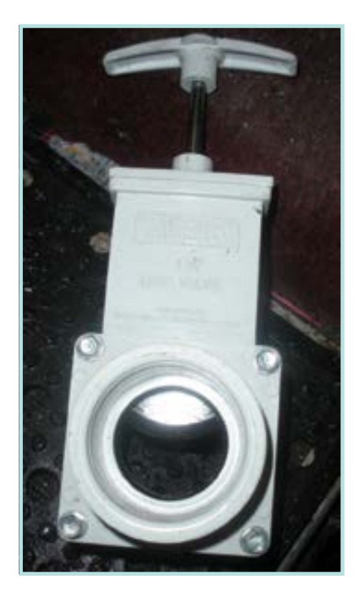
Figure 2. Knife valve.

Occasionally, slice or knife valves are installed in homes. The valves generally are accessed through a holdout in the basement floor and can be turned off and on easily in the event of flooding or sewage backup. Once closed, a slice valve will not allow sewage flow in either direction, so toilets and water cannot be used in the home. (Figure 2)