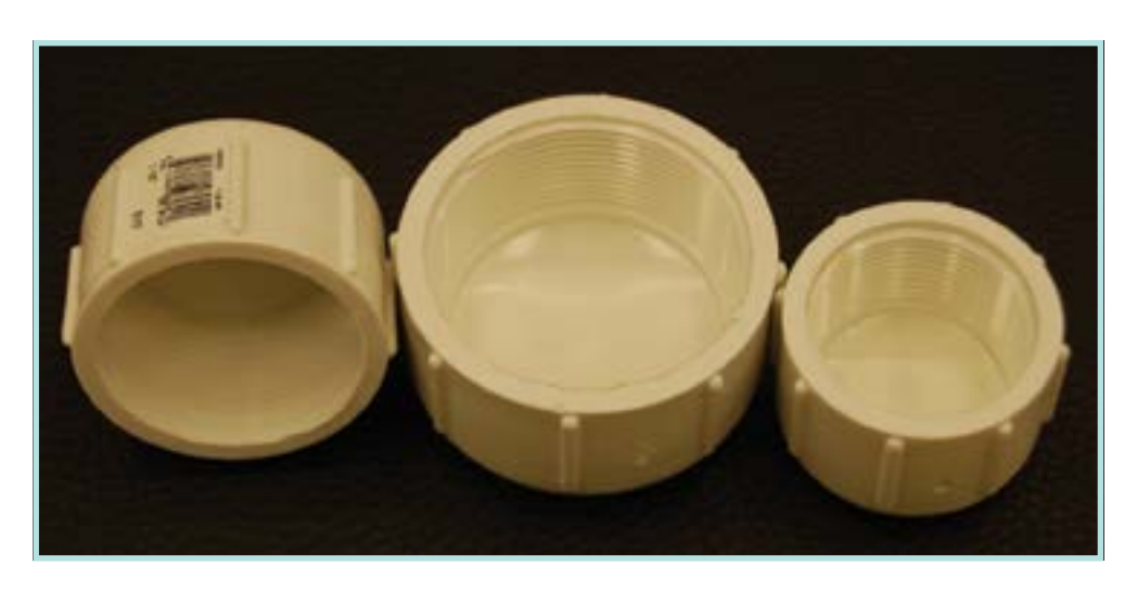
Figure 9. Threaded caps.