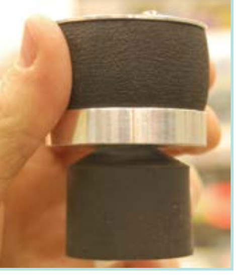
Figure 7. Floating backflow valve.