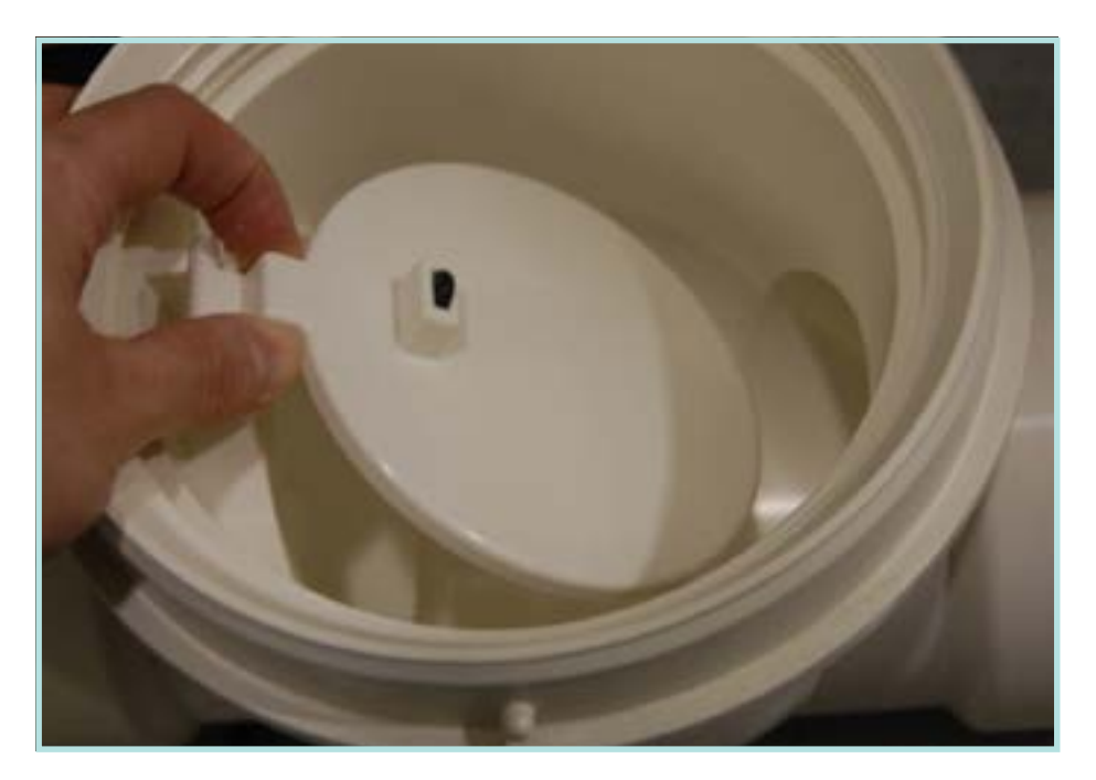
Figure 1. Backwater check valve.

A backwater valve can be installed in an existing home. Have a licensed contractor install an interior or exterior backwater check valve in your sewage system. If you do not have a backwater valve, plugs with backflow devices can be installed in floor drains. These plugs have a ball or float that will stop water or sewage from backing up into a home while permitting water to flow into the drain. These plugs can be left in place year-round.