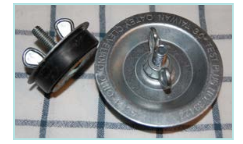
Figure 4. Twist plug.