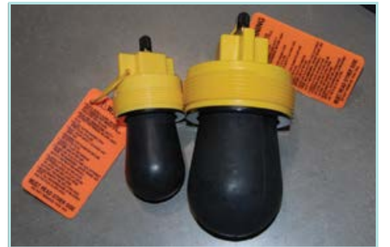
Figure 3. Test ball.