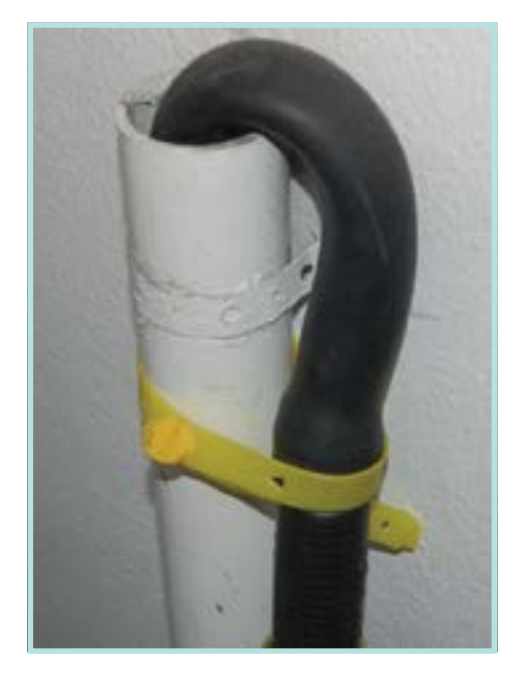
Figure 15. Washing machine drain hose.

Sealing bathtubs depends on the drain in the tub. If an access panel was installed for the bathtub plumbing, remove the drain pipes and install threaded caps or drain plugs. If no access to the internal plumbing is available, place a twist plug in the drain.