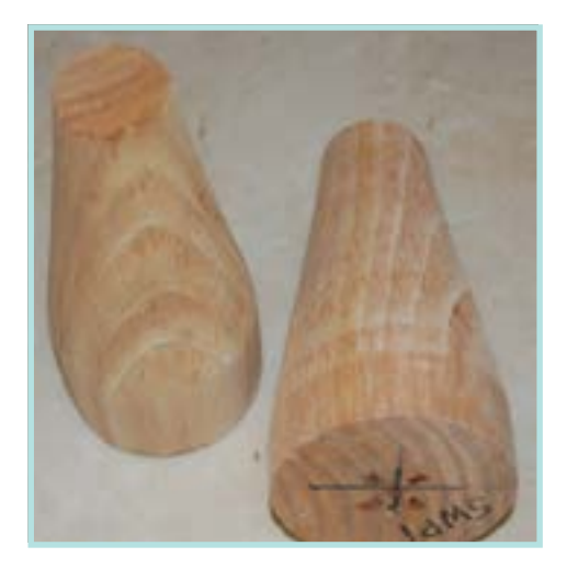
Figure 5. Pressure plug.

These are permanent plugs that can be installed in floor drains. The plugs have a ball or float that closes off when a backflow occurs. When sewage begins to back up in the pipe, the ball or stopper will float up and seal off the pipe. These valves can be left in place year-round but should be checked at least annually to ensure they are working properly. (Figure 6, 7, 8)